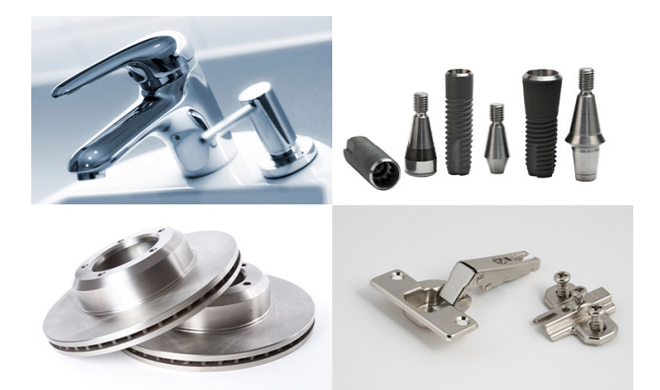
The proportional counter tube is typically used to measure hard coatings on steel or hard metal, chrome coatings on fittings and machine components, silver coatings in the energy supply sector, electroless nickel coatings on structural components, and zinc or nickel coatings on fasteners and fittings.

contrast, closely spaced peaks such as gold and platinum can be analyzed with high separation accuracy using the Si PIN diode and the SDD.